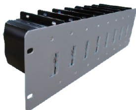
For 8 pcs