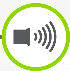
INTELLIGENT DOOR SENSOR