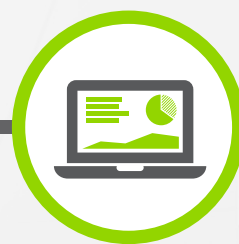
POWER IQ DCIM SOFTWARE